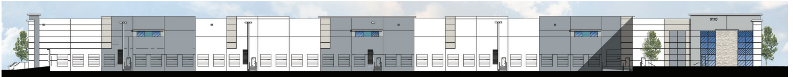
EAST ELEVATION - WILSON AVE