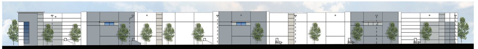
WEST ELEVATION - INTERIOR ELEVATION