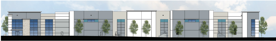
NORTH ELEVATION - RIDER AVE